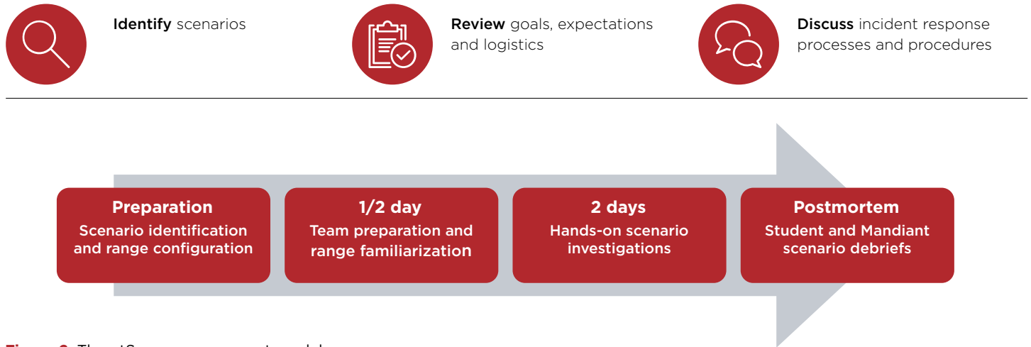
Figure 2. ThreatSpace engagement model.